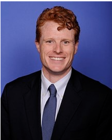
Joseph Kennedy III

Former Croatian President Ivo Josipovic told our Global Dialogue that he has recommended to his Social Democratic Party in Croatia the vision of a moral capitalism as its program for reform in Croatia.