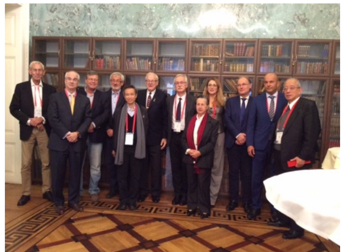
Global Dialogue Participants

Secondly, we looked at the ethics of migration and immigration, social forces which are destabilizing the U.S., European Union and societies wherever migrants and refugees are generated by state failure and harsh conditions. We proposed a statement of ethics to supplement laws and emotions focused on the right to live in a new homeland. We considered the ethics of hosts and guests, of friends and of citizens as standards for how residents and newcomers should respect one another.