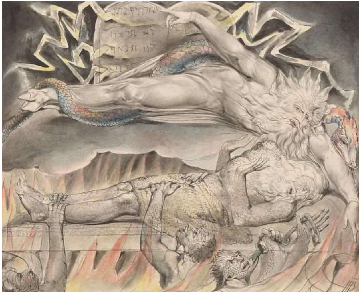
Job's Evil Dream by William Blake (1805 – 1806)

Job 5:7: “Yet man is born to trouble, as the sparks fly upward.”