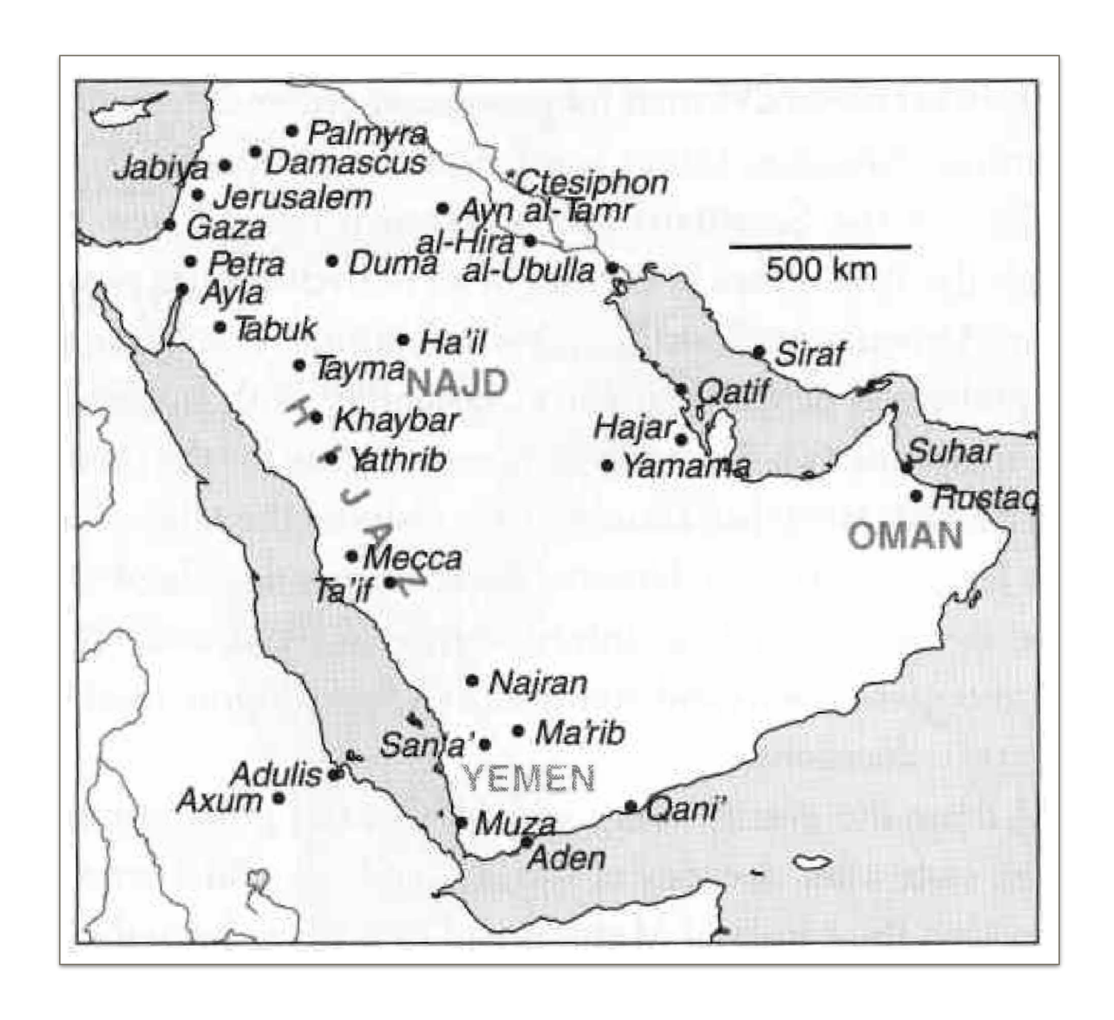
Appendix 2 MAP OF ARABIA, CA 600 CE