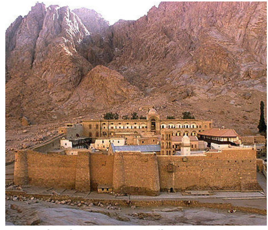
Saint Catherine's Monastery (Sacred Monastery of the God-Trodden Mount Sinai)

to burn mosques or desecrate churches, fuel suspicion between faiths, as well as towards faith itself. The urgency today, as the Covenants also reflect, is to grow obedience to God's law by being inclusive and ever more generous towards those who have different beliefs. In a sense, the moral authority of all religions is being tested today as we try to meet the unprecedented challenges for collaboration demanded by climate change, economic inequality, intolerance, and the other injustices undermining human dignity.