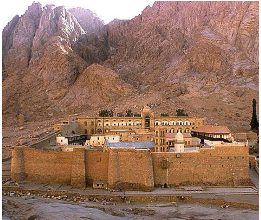
Saint Catherine's Monastery (Sacred Monastery of the God-Trodden Mount Sinai)